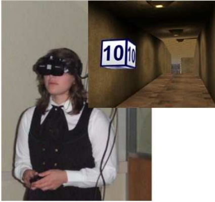
Figure 1: Setup using a HMD and a view of the used Virtual Environment.

The desktop used in this study had a 19" Wide Screen monitor with a resolution of 800 \times 600 pixels, and the screen was 1,4m \times 1,5m and placed in front of the user at approximately 1m .